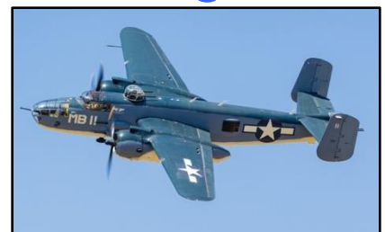
The PBJ may Fly! (weather, maintenance, and ops permitting)