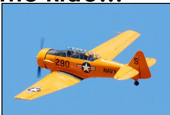
SNJ / T-6