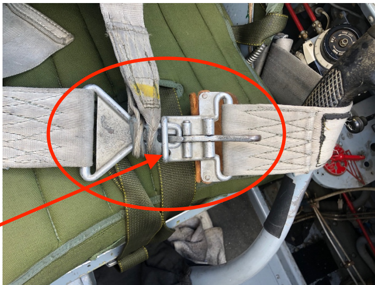
Standard Four Point Harness

Aircraft Type: Grumman F6F Hellcat Registration: N1078Z Pilot Name: Emergency Contact Name: CAF Operations Officer Emergency Contact Number: Date: